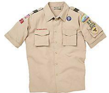
Men's/Youth Short-sleeve Cotton Rich Poplin Shirt